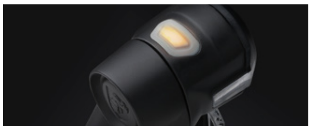
Ergonomic on/off button with battery low indicator